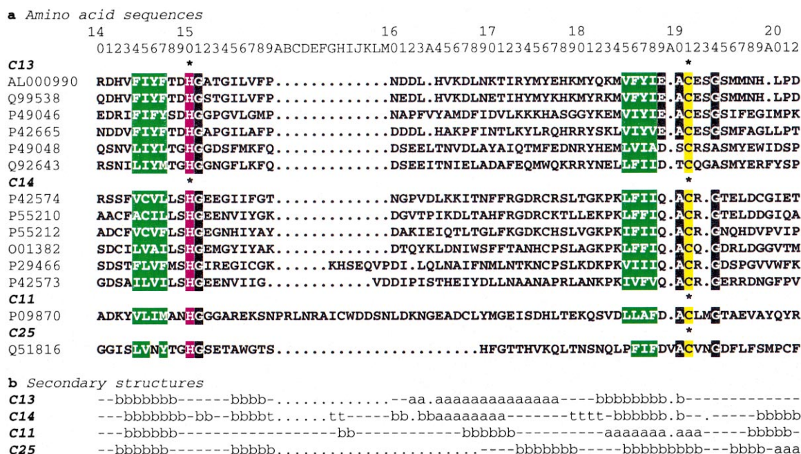
Fig. 3. Alignment of the catalytic sites of cysteine endopeptidases of families of legumain (C13), caspase-1 (C14), clostripain (C11) and gingipain R (C25). a: The sequence segments containing the known or putative catalytic residues (magenta and yellow) in each of the four families were aligned manually by the introduction of gap residues '-'. It can be seen that two or three residues N-terminal to each of the catalytic residues there is a block of four predominantly hydrophobic residues (green). Other residues that tend to be conserved between the families are printed in white on black. Asterisks are placed over the His and Cys residues in each family for which they have been identified experimentally as catalytic, and in addition the His residue in family C25 was proposed to be catalytic by Pavloff et al. [19] on the basis of its conservation in the family. Key to sequences: AL000990, mouse legumain; Q99538, human legumain; P49046, jack bean ( Canavalia ensiformis ) asparaginyl endopeptidase; P42665, Schistosoma japonicum haemoglobinase; P49048, Caenorhabditis elegans hypothetical protein T05E11.6; Q92643, human GPI8 protein; P42574, human caspase 3; P55210, human caspase 7; P55212, human caspase 6; O01382, Drosophila melanogaster caspase; P29466, human caspase 1; P42573, Caenorhabditis elegans CED3 protein; P09870, Clostridium histolyticum \alpha -clostripain; Q51816, Porphyromonas gingivalis gingipain R. b: The corresponding secondary structures are those determined crystallographically for human caspase-1 (family C14; PDB 1IBC) or predicted for the C13, C11 and C25 families by the PHD program [20]. The \beta -strand residues are marked 'b', the \alpha -helix residues 'a' and the turn residues 't'. Both catalytic residues in family C14 are preceded by \beta -strands (strands S3 and S4, respectively) and with one exception these strands (containing the blocks of hydrophobic residues noted in a above) are predicted for the other families. The secondary structure elements shown here for the caspase family can be seen in the three-dimensional representation of Fig. 4.

was compared with sequences of cysteine peptidases in other families. As shown in Fig. 3, it was found that a motif His-Gly-spacer-Ala-Cys could be recognised not only in the legumain family but also in the families of caspase-1 (C14), clostripain (C11) and gingipain R (C25). The caspases are mammalian cytosolic endopeptidases that play key roles in apoptosis, whereas clostripain and gingipain are cysteine endopeptidases from the pathogenic bacteria Clostridium histolyticum and Porphyromonas gingivalis , respectively [15,16]. The cysteine residues in this motif have already been identified as the catalytic cysteines of all three of these other families [17–19] and the histidine has been identified as catalytic in C14 [18] and suggested tentatively for C25 [19]. Closely preceding each of the catalytic residues in all four families is a block of four hydrophobic amino acids (marked in blue in Fig. 3a). The corresponding parts of the secondary structures predicted for mouse legumain, clostripain, and gingipain R by